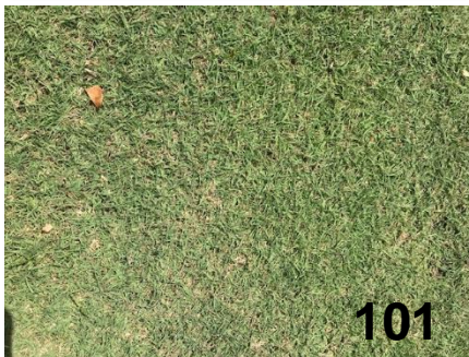
No Stunt and Generic Trinexapac-Ethyl