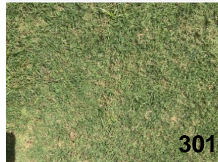
No Stunt and Generic Trinexapac-Ethyl