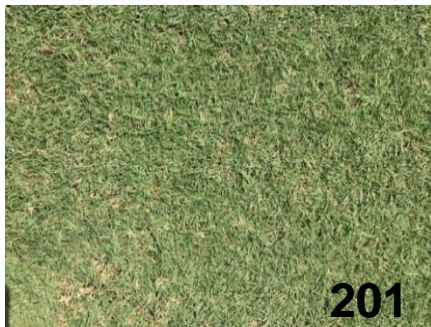
No Stunt and Generic Trinexapac-Ethyl